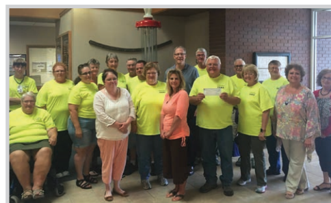
Butler County Emergency Response

White Eagle was pleased to support the Butler County Community Emergency Response Team (CERT) with a $500 donation. CERT is a group of trained civilian volunteers who are involved in a wide variety of activities throughout the year. During emergencies and disasters, CERT may be called upon to help with evacuations, search and rescue, damage assessments, traffic control and more.