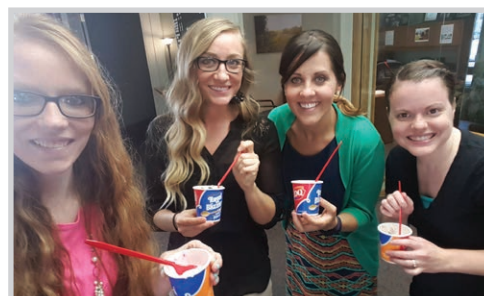
DQ Miracle Treat Day

On July 28, White Eagle employees participated in Miracle Treat Day with Dairy Queen (DQ®). For every Blizzard Treat sold on this day, DQ stores donate $1 or more to local Children's Miracle Network hospitals, including Via Christi Hospitals in this area. Donations this year were expected to total more than $5 million across the United States and Canada. These donations help provide support for more than 32 million patient visits each year to local Children's Miracle Network Hospitals.