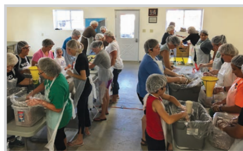
Meals for Numana

A team of 23 White Eagle employees and family gathered from all of our branches Tuesday, July 19 to package nearly 6,300 meals for Numana, Inc., an international hunger relief organization. These meals were served to homeless and low-income families in Wichita on August 6 at the Convoy of Hope event along with many other free services offered to those in need.