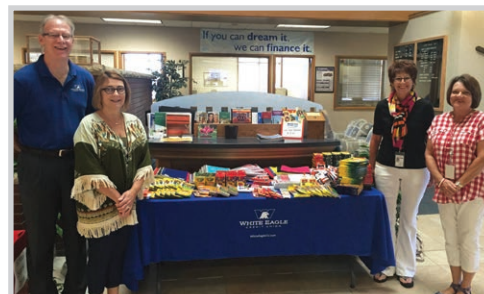
Bright Futures School Supply Drive and Donation

For more than a decade, Bright Futures Augusta has helped students in need of school supplies. In August, we partnered with Bright Futures Augusta for the annual Back to School Supply Drive. White Eagle was a drop-off location for the community to help get supplies to students in need. Not only do we participate by being a drop-off location, but the branches also donate school supplies. This year, along with our members' donations, White Eagle donated $100 worth of school supplies. Although this program is specific to the City of Augusta, White Eagle holds school supply drives at the El Dorado and Newton locations as well. Separately, White Eagle also made a $2,500 donation to Bright Futures.