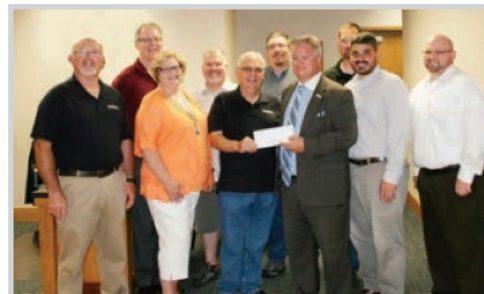
Shryrock Park Splash Pad