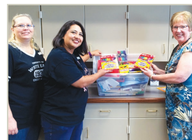
School Supply Drive

For over a decade Bright Futures Augusta has helped students in need of school supplies. In August, we partnered with Bright Futures Augusta for the annual Back to School Supply Drive. White Eagle was a drop-off location for the community to help get supplies to students in need. Not only do we participate by being a drop-off location, but the branches also donate school supplies. This year in Augusta alone, with the community's help, Augusta Bright Futures was able to fill 45 backpacks for students in need. Although this program is specific to the City of Augusta, White Eagle holds school supply drives at its El Dorado and Newton locations as well.