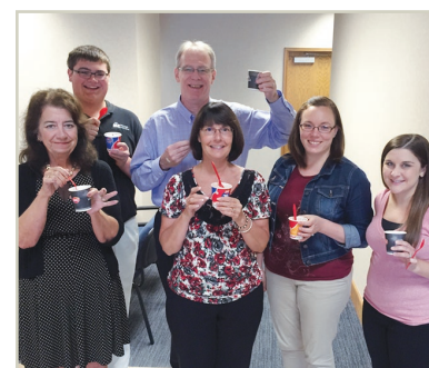
Miracle Treat Day

On July 30, White Eagle employees participated in Miracle Treat Day with Dairy Queen (DQ®). On a special day every year, local DQ stores participate in Miracle Treat Day. For every Blizzard® Treat sold, $1 or more is donated by your local participating DQ store to your local Children's Miracle Network Hospital®. According to the Miracle Treat Network website, this year nearly $2 million will be donated to Children's Miracle Network Hospitals across the United States. At White Eagle we are proud to be able to participate in any way we can to support our local Children's Miracle Network Hospital – Via Christi Health. For more information visit miracletreatday.com .