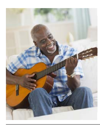
Get the rewards you want with...